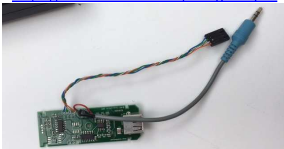
Oem version available