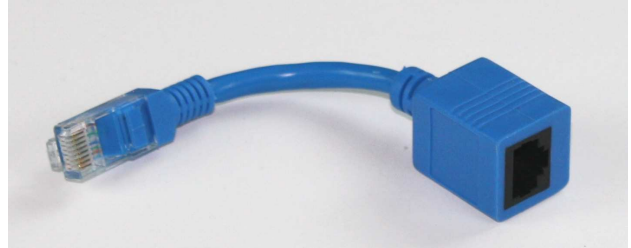
RJ45 male-female cable that reverses mode B blue and brown pairs are swapped

Cisco IP Phones: 7902G 7905G 7910G 7910G +SW 7912G 7940G 7960G 7962G 7975G 7985G