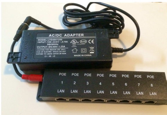
Changing all 8 ports to reverse PoE

Mix new and old Cisco phones on the same injector panel, use any Ethernet switch and add PoE to that switch at low cost.