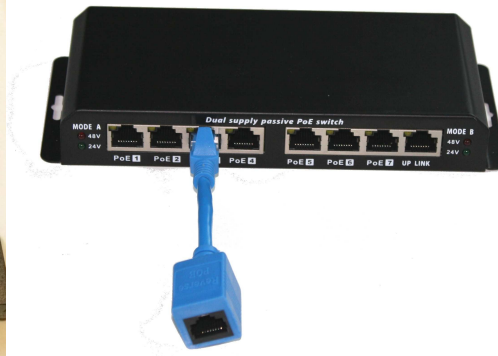
Changing one port to Reverse PoE