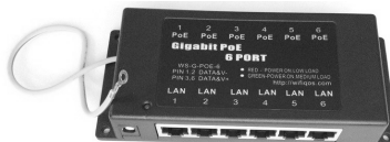
6 port wall mount