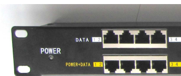
12 to 24 port rack mount