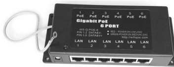
6 port wall mount