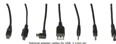
optional adapters adapters not included

WiFi-Texas.com Inc 815-A Brazos #326 Austin Tx, 78701 512 479 0317 http://wifiqos.com