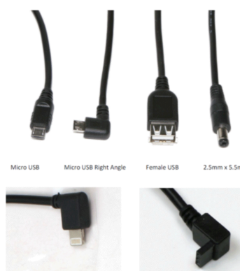
adapters not included

DC connector options - see other listings for each type.