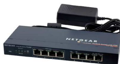
Any PoE Switch