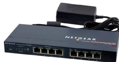
Any PoE Switch