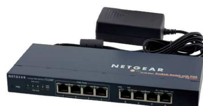
Any PoE Switch