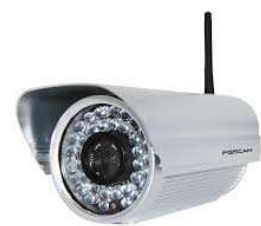
Power non-PoE Cameras