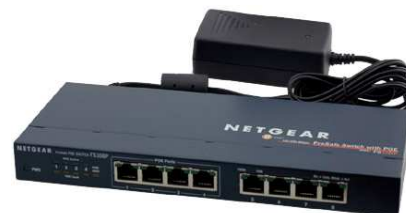
Any PoE Switch