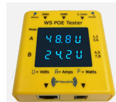
PoE tester to display power/voltages