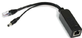
12v and 5v active Splitters for Passive and 802.3af