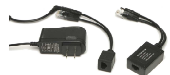
Injector for 1 device