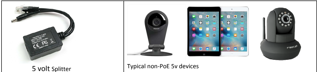
5 volt Splitter